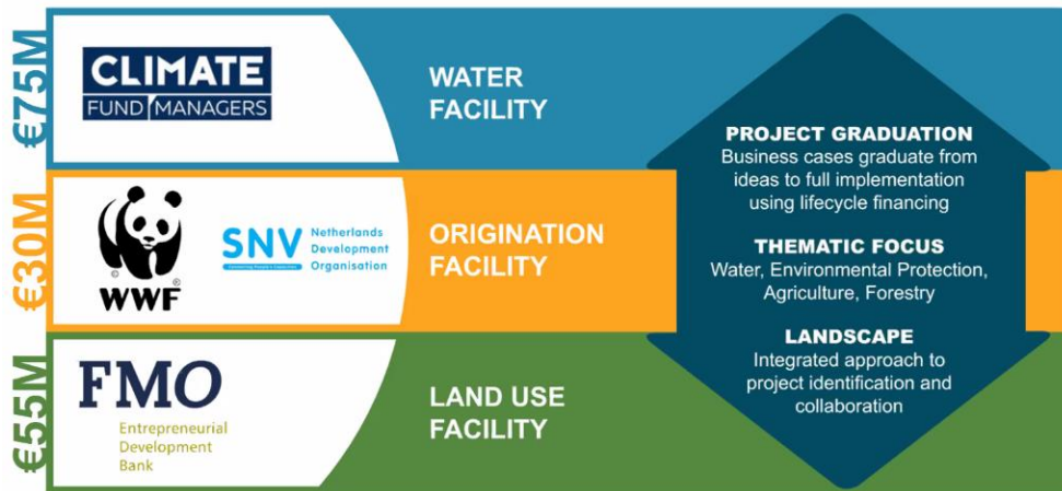
DFCD: three facility lines

development finance institutions, philanthropies, corporates, banks and investors to replenish the facilities (see below) and/or co-invest in portfolio companies.