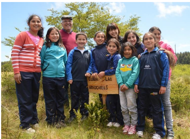
The children from Las Araucarias school