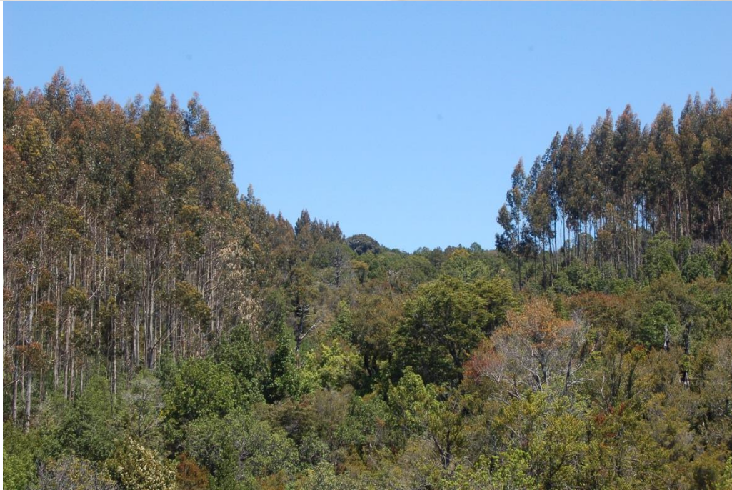
Native forest regenerating between eucalyptus plantations, Valdivian Coastal Reserve