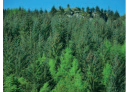
Non-native trees can diversify forests in regions with few native tree species, as typical in north-western Europe; here Sitka spruce and Japanese larch in Scotland.

well in harsh environments where native species may struggle, or they can produce especially large quantities of wood that can be used as a versatile and climate-friendly natural resource.