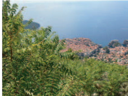
Plantations of non-native trees can be used on many soils which are hard to cultivate, for example on dry, sandy soils or in karst regions, where erosion is a serious problem; here a group of Ailanthus altissima trees close to Dubrovnik, Croatia.