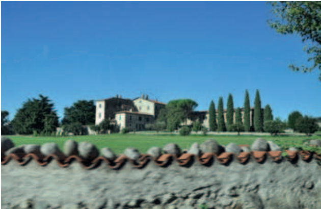
Mediterranean cypress in Italy; despite being an iconic landscape element this tree species is non-native to Italy.

species, and include them in their culture. Another example is black locust – the most controversial non-native tree species in Europe, and the most widespread one. While condemned by many and considered a real pest, it is perceived as a native species for example in some south-eastern European countries, where people are grateful for the high quality timber, the stabilisation of dry slopes and the ‘acacia’-honey. While in these countries strong restrictions on the planting of non-native tree species have been put in place in recent years, these restrictions would not apply to black locust and some other established non-natives.