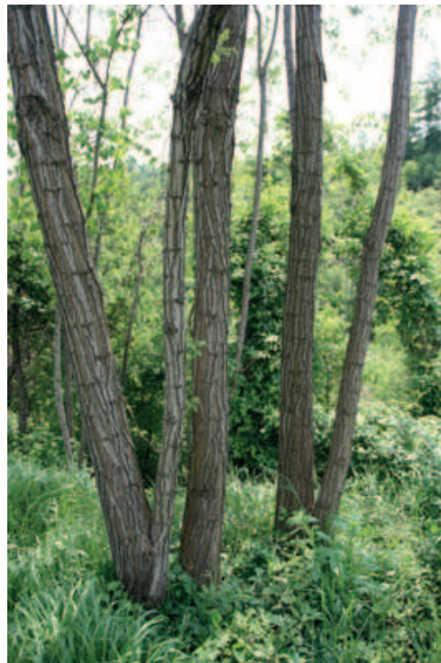
Black locust stems that have sprouted from a single root system.

Non-native trees planted for non-forestry purposes, e.g. in gardens and parks, along the streets and railways, or abandoned plantations may also be especially problematic. Since these trees are not monitored by a forester, they may spread into adjacent natural habitats freely, without anyone feeling responsible.