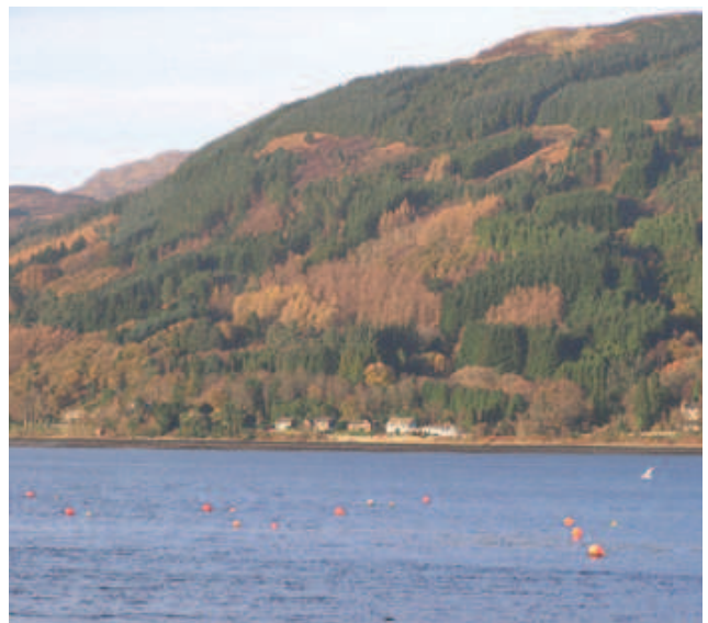
Image of forest diversity, Kilmun Arboretum, western Scotland. Trial site for more than 280 tree species of which over 180 tree species survived.

species were introduced to Europe two to three centuries later, when travelling around the globe became easier and plant hunting explorations became more frequent. Today, the number of new tree species introductions into Europe is low. Yet, certain non-native tree species tested and grown in one region may not yet have been considered for planting in other countries, and their range in Europe might still expand. Interestingly, the reproductive material (i.e. seeds) of the more important non-native tree species is mainly collected in existing stands or seed orchards in Europe, and is no longer imported from the area of origin, for example North America.