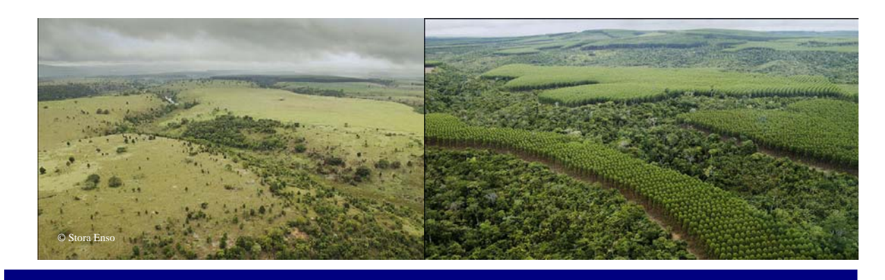
New Generation Plantations Project June 2009