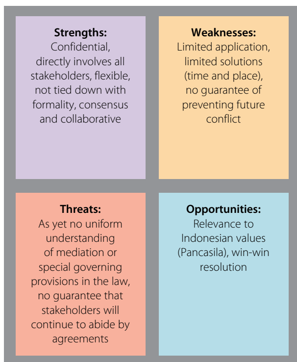
Figure 2. SWOT analysis of conflict mediation application in Indonesia.

Before describing various types of mediation in Indonesia, we present a diagram of a Strengths, Weaknesses, Opportunities, and Threats (SWOT) analysis. This analysis has its basis in the opinions of an expert from the Supreme Court, as well as key interviews with mediation experts and practitioners. The results of the analysis are summarized in Figure 2.